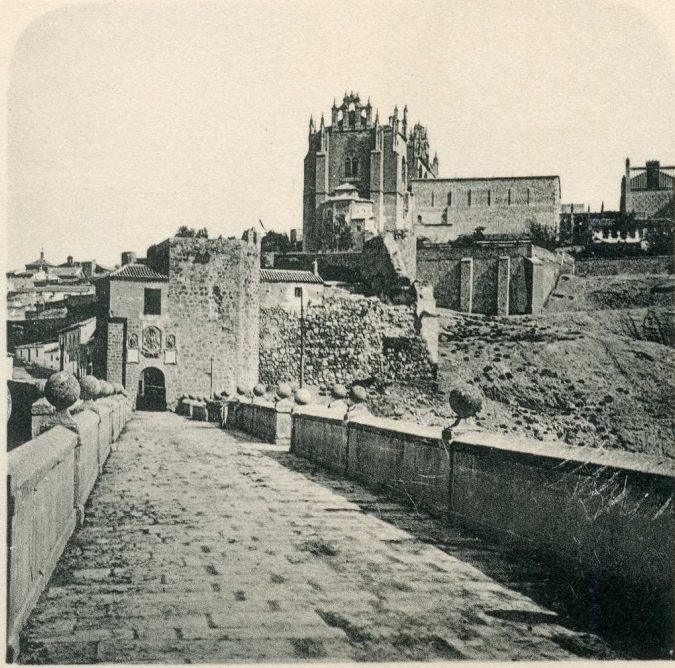
NAKLADATEL B. KOČÍ V PRAZE 1906.